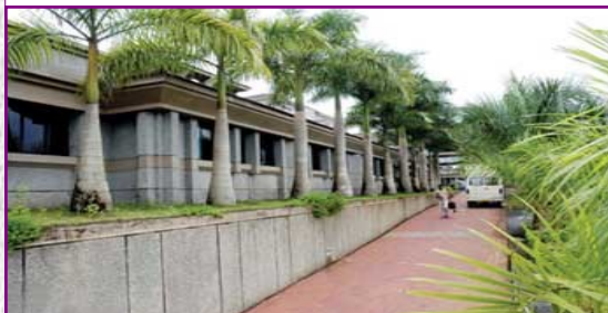
Malabar Cancer Centre, Moozhikkara (PO)Thalassery , Kannur Kerala –PIN

Division started functioning during end 2014 under department of clinical laboratory services and translational research. Division is fully equipped with the state of art equipment for molecular studies. Division is mainly focusing to understand the molecular mechanism of tumorigenesis. Along with molecular research, division is also involved in the molecular diagnosis. Division is also focused on the HR development by providing short-term training for BSc, MSc life Science and B Sc MLT students and dissertation works for MSc/MD/MDS course.