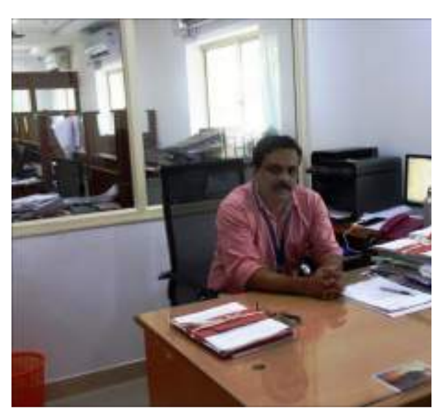
areas that it has concentrated. We commend the entire medical team for this fantastic effort which is worthy of great praise

There has also been noticeable improvement in key areas like clinical excellence, patient care, community related programmes etc: - A series of sustainable strategic actions were designed to enhance organizational capabilities and improve patient care. In our journey of continuous improvement our prime task has been to strengthen our clinical framework. This is being carried out by continuous focus on talent, training, processes and following clinical pathways. We are indeed proud to say that today; MCC occupies a preferred place in many of the clinical