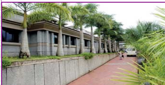
Malabar Cancer Centre, Moozhikkara (PO)Thalassery , Kannur Kerala –PIN

Division started functioning during end 2014 under department of clinical laboratory services and translational research. Division is fully equipped with the state of art equipment for molecular studies. Division is mainly focusing to understand the molecular mechanism of tumorigenesis. Along with molecular research, division is also involved in the molecular diagnosis. Division is also focused on the HR development by providing short-term training for BSc, MSc life Science and B Sc MLT students and dissertation works for MSc/MD/MDS course.